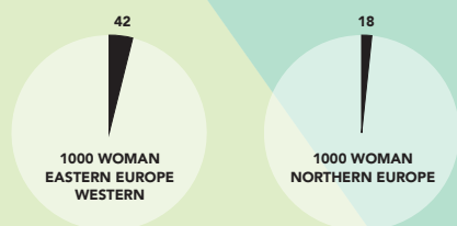
LOW USAGE OF OR DIFFICULT ACCESS TO MODERN AND EFFECTIVE CONTRACEPTIVES HIGHER ABORTION RATE 2010-2014 THERE WERE 42 ABORTIONS PER 1000 WOMEN IN EASTERN EUROPE WESTERN AND NORTHERN EUROPE THIS FIGURE WAS FAR LOWER, NAMELY 18 ABORTIONS PER 1000 WOMEN'

In places where there is a low usage of or difficult access to modern and effective contraceptives, there is a much higher abortion rate compared to countries where contraceptives are easily obtainable. This trend can be observed in Europe as well: between 2010-2014 there were 42 abortions per 1000 women in Eastern Europe, whilst in Western and Northern Europe this figure was far lower, namely 18 abortions per 1000 women. The main reason for this gap is the high levels of unmet needs for contraception in Eastern Europe and the lower use of effective contraceptive methods in general 7 8 .